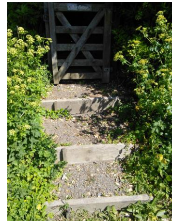
Steps to garden area