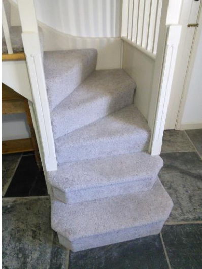
Bottom of stairs