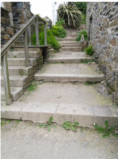
Steps to Caretakers store