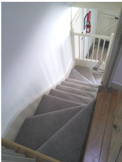
Looking down from top of stairs