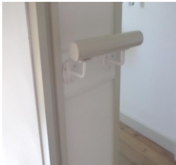
Handrail at top of stairs to landing