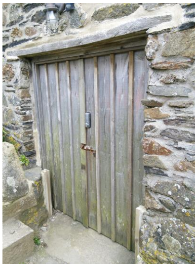
Store Containing key safe