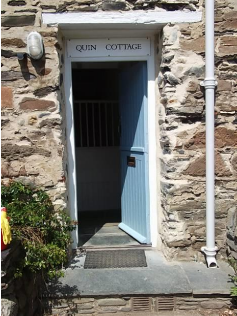
Quin Cottage front door