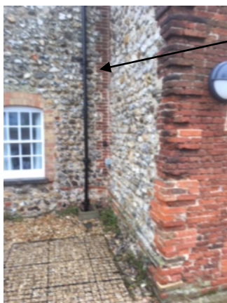
Front door (main entrance) key safe location

The keysafe at the front is located to the left of the porch at a height of 1.3m. Front door handle at 750mm height.