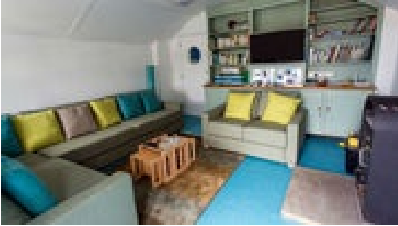
Snug sitting room – hard floor surface throughout the accommodation.