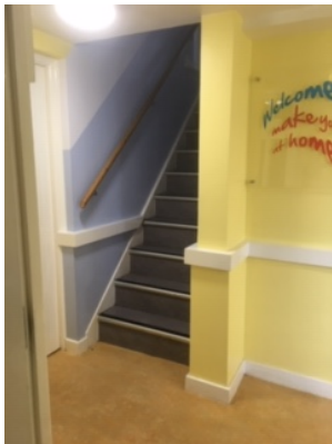
Front entrance staircase - emergency exit

The front entrance staircase is a straight flight with 11 steps at 220mm height, 240mm tread, with a handrail on the left as you ascend.