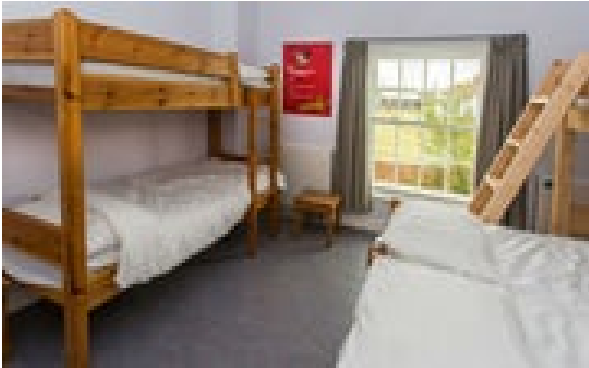
Example of one of the dormitory bedrooms

Bottom bed mattress height of 550mm and top bunk mattress height of 1470mm. Minimum clearance between furniture in the dormitories is as follows: Shelduck 430mm, Oystercatcher 850mm, Avocet 930mm, Redshank 750mm.