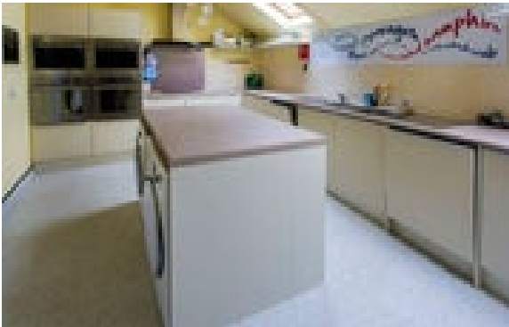
kitchen from dining room with door to stairs on left

Please note there is an induction hob at this cottage. Guests with pacemakers are advised to check with their doctor to ensure there will be no interference with their pacemaker. Guests with pacemakers are also advised to keep a distance of at least 60cm (2ft) from the hob when cooking