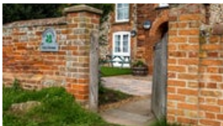
Front gate access to main entrance

Outside the building there is a paved path to both doors and the front gate is accessible via a small grassed, uneven area from Harbour Way (tarmac road).