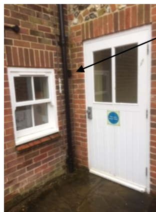
East courtyard side entrance and keysafe location

There is an alternative side door within the East courtyard (opposite the sailing club) which is 830mm wide and opens outwards. Access to the side door is via a gravel courtyard which has a gate with opening 950mm wide. Keysafe to left of door is at a height of 1.3m.