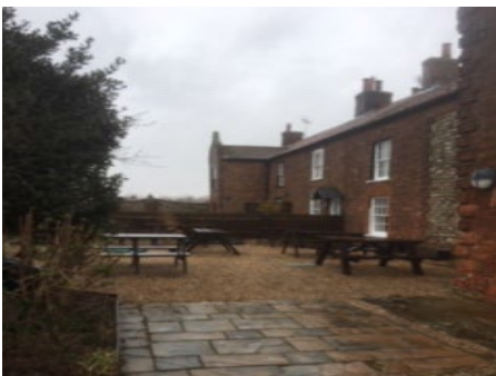
Front courtyard garden area with picnic benches

The front garden area is paved leading onto gravel. Enclosed by a brick wall of approx. 1m height which has two hand gates, providing a secure outside space. Ample seating with picnic benches is provided for the number of guests.