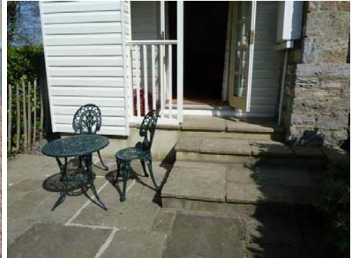
2 steps down from kitchen Step up from sitting room