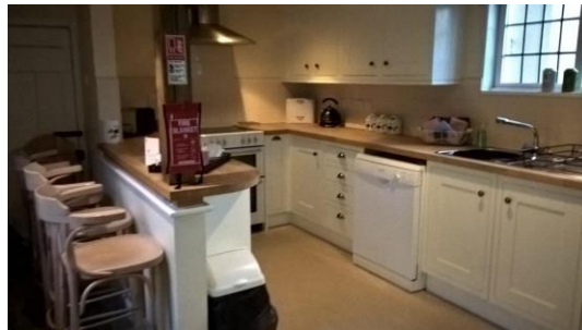
Kitchen with breakfast area to left