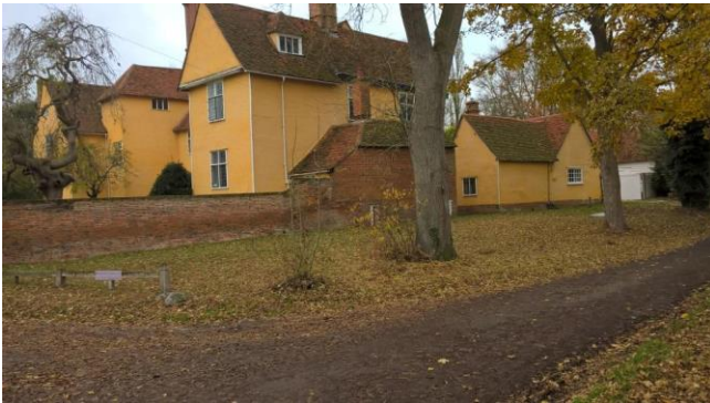
Thorington Hall from the junction of the main road and the side lane