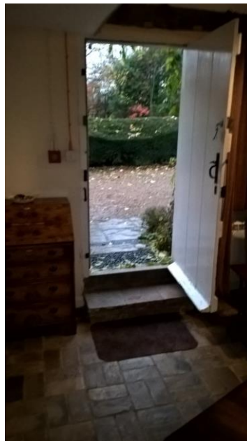
Steps down to sitting room