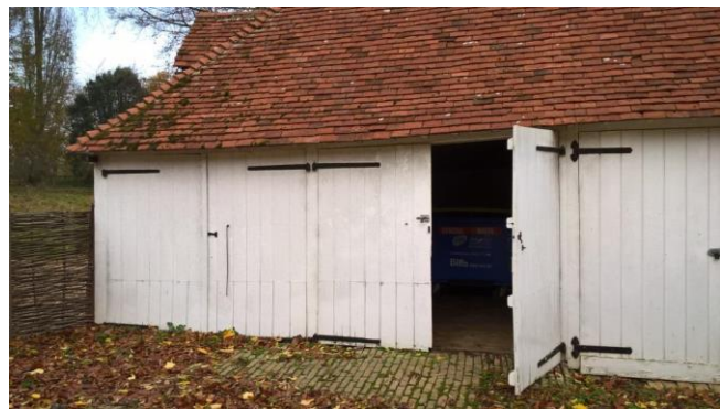
Outbuilding for refuse storage