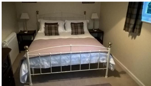
King size bedroom