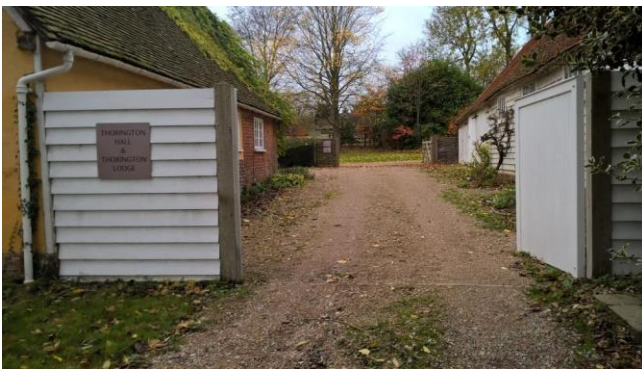
Outer entrance gates to gravel drive