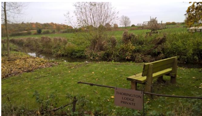
Riverside seating area