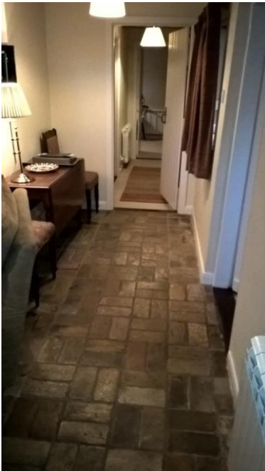
Sitting area with inner corridor ahead and kitchen door to right