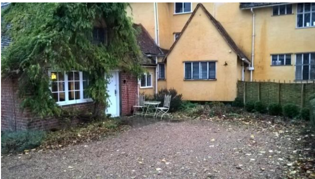
Parking area / front courtyard