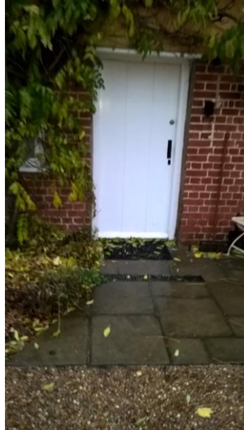
Front door with keysafe to right