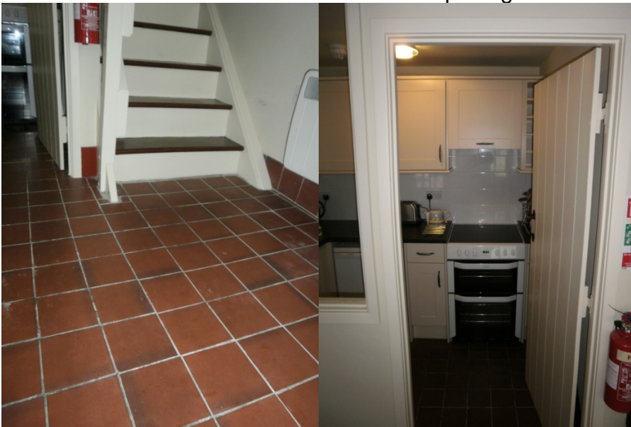
View showing flooring and stairs